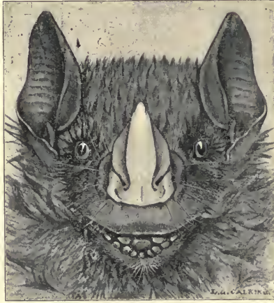
FIG. LXXIII. ARTIBEUS JAMAICENSIS. JAMAICA BAT.

Artibeus carpolegus Gosse, Nat. Sojourn in Jamaica, 1851, p. 271, pl. VI, fig. 5.